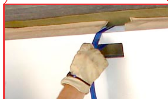
PANEL ATTACHMENT SYSTEM DETAIL