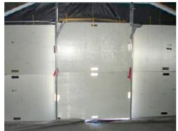
INTERIOR OF SLIDING SHELTER DOOR

IT IS DESIGNED TO BE INSTALLED IN 60 MINUTES BY 4 SOLDIERS.