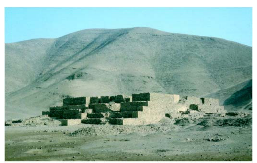
Temple at El Paraiso