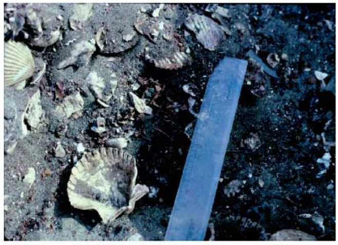
Ostra site Shell and fish remains